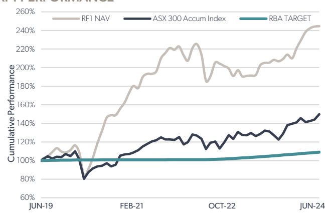
Chart represents cumulative performance of RF1 NAV since inception on 17 June 2019. Net of fees and costs. Performance figures assume reinvestment of income. Past performance is not a reliable indicator of future performance.